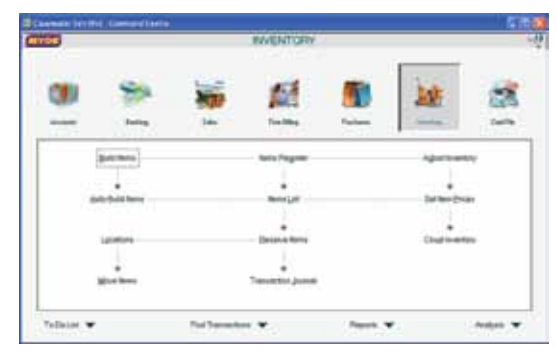
Easily manage your inventory