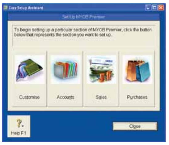
Easy to set up and use