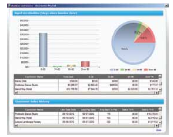
Quickly view your financial position